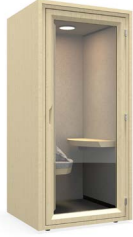
Glazed front, Upholstered back PWP-GPB