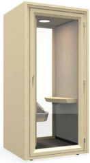
Glazed front & back PWP-GGB