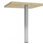
Chrome pole leg