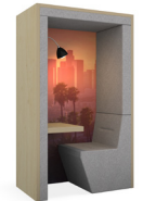
Graphic back BKP