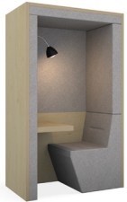
Flat roof, 1 Seat PBP-FSB