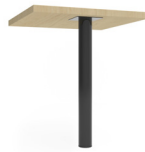
Black pole leg