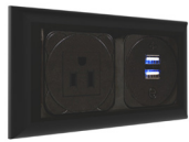
Basic power socket