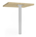
White pole leg