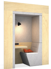
Surround Infill INF