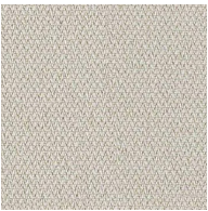
Ceiling Camira Era Futurist CSE01 LRV 49.88%