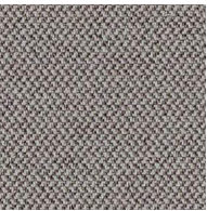
Wall Panels Camira Era Generation CSE02 LRV 24.51%