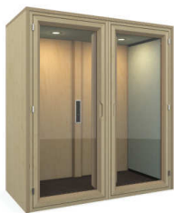
Glazed front, Solid back PMP-GPB