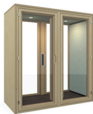
Glazed front & back PMP-GGB