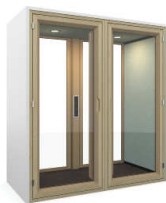
Solid - MFC