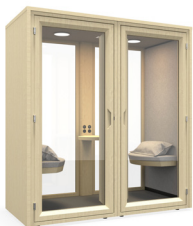
Built-in Seating SBL