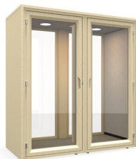
Custom Seating SCU