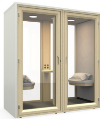
1.5" LPL M36