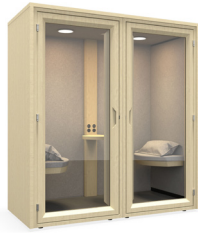
Glazed Front, Upholstered back PMP-GPB