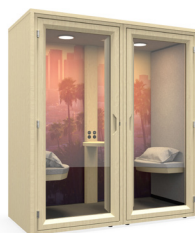
Custom Graphic GRA