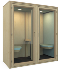
Glazed front, Solid back PMP-GPB