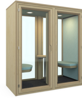
1 1/2" Ply P36