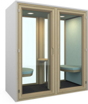
1 1/2" MFC M36