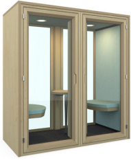
Glazed front & back PMP-GGB