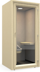
Glazed front, Upholstered back PWP-GPB